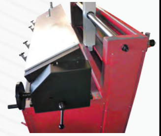
-45 to +20° rotating table adjustment