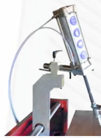
Piston movement: 200 mm